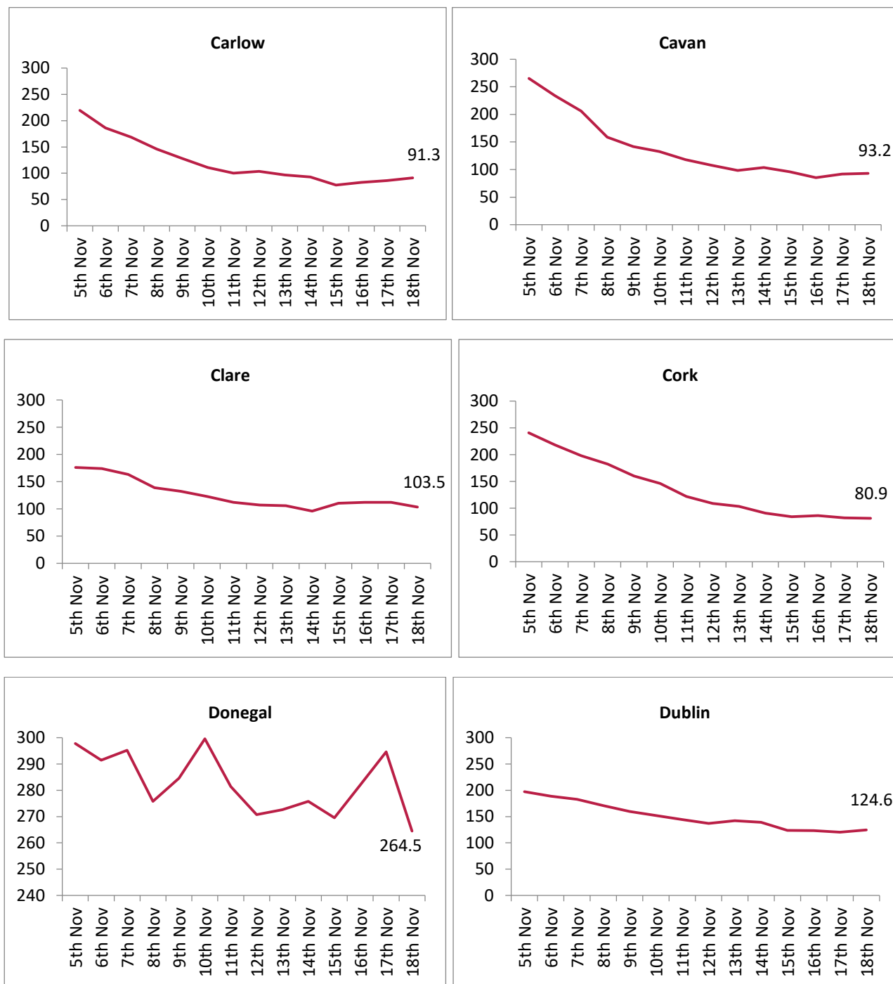
Figure A. 14 day cumulative incidence rates per 100,000 population of confirmed cases of COVID-19 by county (November 5 th to 18 th 2020)